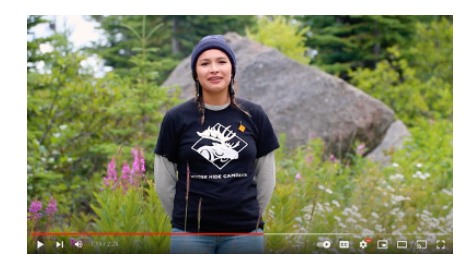
This is the Moose Hide Campaign

With the growth of Tik Tok, we also encourage you to be creative with your personally made videos sharing why you are supporting the Moose Hide Campaign!