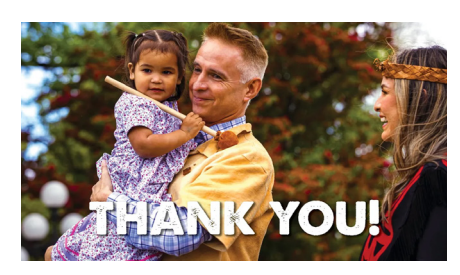
Moose Hide Campaign Day 2024 Recap